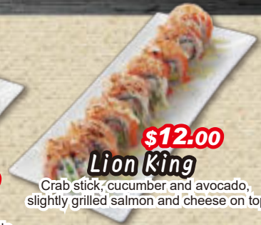
$12.00 Lion King

Tuna salad and cucumber inside, avocado and tobiko on top