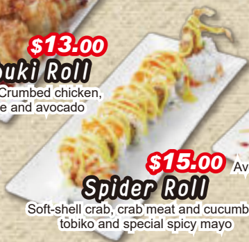
$15.00 Spider Roll

Tempura sushi. Crumbed chicken, cream cheese and avocado