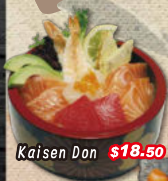
$18.50 Kaisen Don