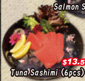
$13.50 Tuna Sashimi (6pcs)