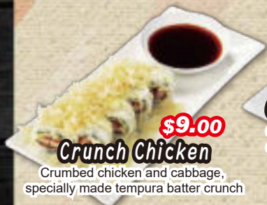
$9.00 Crunch Chicken

Crumbed chicken and cabbage, specially made tempura batter crunch