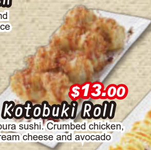
$13.00 Kotobuki Roll

Crumbed prawn, avocado and boiled prawn on top with mustard mayo