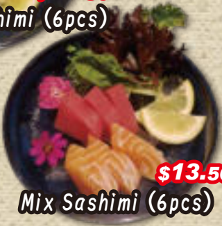
$13.50 Mix Sashimi (6pcs)