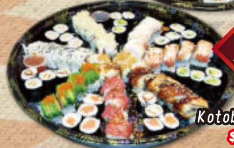
$60.00 Kotobuki Platter

Sake x2, Ebi, Maguro, Hotate, Tamago This Nigiri set menu can not be changed