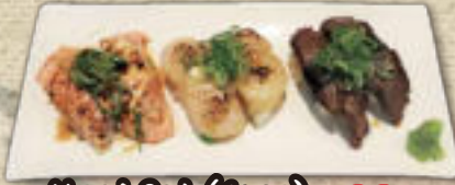
$14.00 Aburi Set (6pcs)

Sake Aburi x2, Hotate Aburi x2, Wagyu x2 This Aburi set menu can not be changed