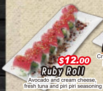
$12.00 Ruby Roll

Salmon, cucumber and avocado, slightly grilled salmon and cheese on top