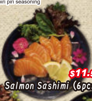
$11.50 Salmon Sashimi (6pcs)