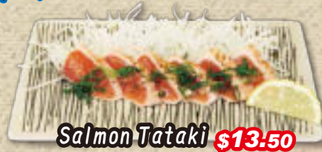
$13.50 Salmon Tataki