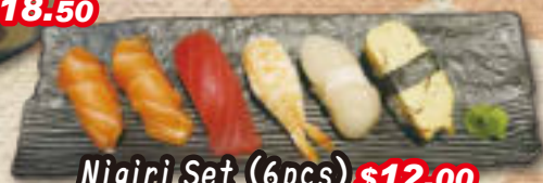
$12.00 Nigiri Set (6pcs)

Sake Aburi x2, Hotate Aburi x2, Wagyu x2 This Aburi set menu can not be changed