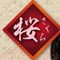
$50.00 Sakura Platter