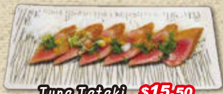
$15.50 Tuna Tataki