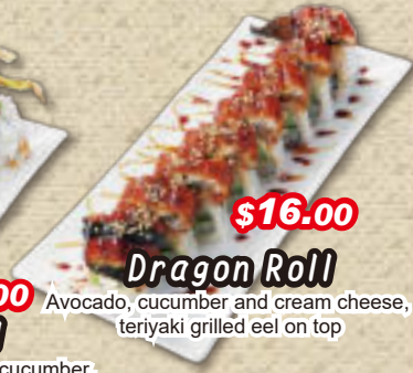
$16.00 Dragon Roll

Soft-shell crab, crab meat and cucumber, tobiko and special spicy mayo