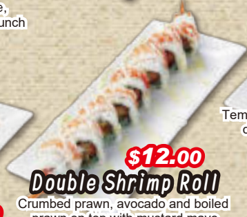
$12.00 Double Shrimp Roll

Avocado and cream cheese, fresh tuna and piri piri seasoning