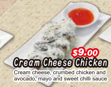
$9.00 Cream Cheese Chicken

Crumbed chicken and cabbage, specially made tempura batter crunch