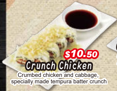
$10.50 Crunch Chicken

Crumbed chicken and cabbage, specially made tempura batter crunch