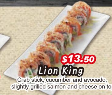
$13.50 Lion King

Tuna salad and cucumber inside, avocado and tobiko on top