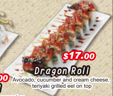
$17.00 Dragon Roll

Soft-shell crab, crab meat and cucumber, tobiko and special spicy mayo