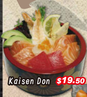
Kaisen Don $19.50