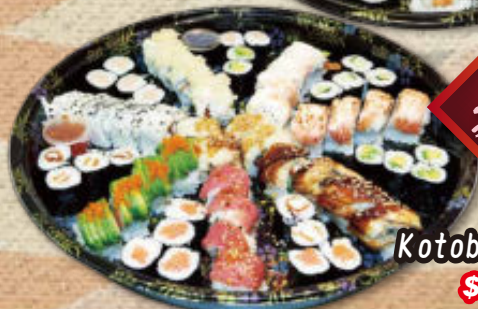
Kotobuki Platter $70.00

Sake x2, Ebi, Maguro, Hotate, Tamago This Nigiri set menu can not be changed