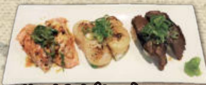
Aburi Set (6pcs) $15.50

Sake Aburi x2, Hotate Aburi x2, Wagyu x2 This Aburi set menu can not be changed