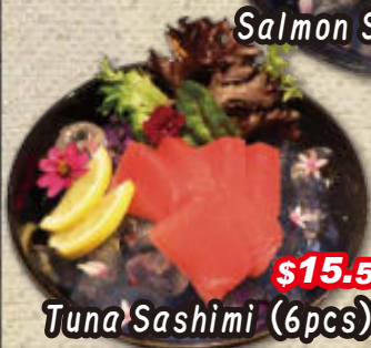
$15.50 Tuna Sashimi (6pcs)