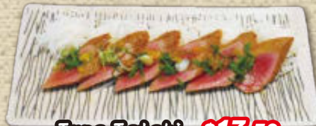
Tuna Tataki $17.50