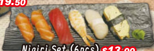
Nigiri Set (6pcs) $13.00

Sake Aburi x2, Hotate Aburi x2, Wagyu x2 This Aburi set menu can not be changed