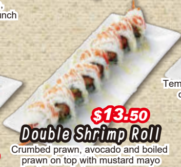
$13.50 Double Shrimp Roll

Avocado and cream cheese, fresh tuna and piri piri seasoning