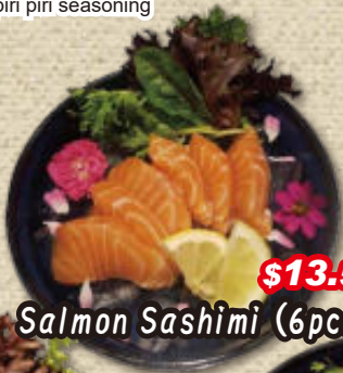
$13.50 Salmon Sashimi (6pcs)