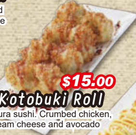
$15.00 Kotobuki Roll

Crumbed prawn, avocado and boiled prawn on top with mustard mayo