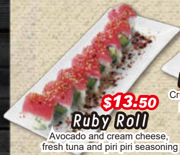
$13.50 Ruby Roll

Salmon, cucumber and avocado, slightly grilled salmon and cheese on top