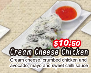
$10.50 Cream Cheese Chicken

Crumbed chicken and cabbage, specially made tempura batter crunch