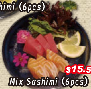
$15.50 Mix Sashimi (6pcs)