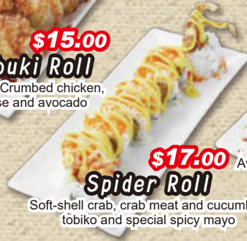
$17.00 Spider Roll

Tempura sushi, Crumbed chicken, cream cheese and avocado