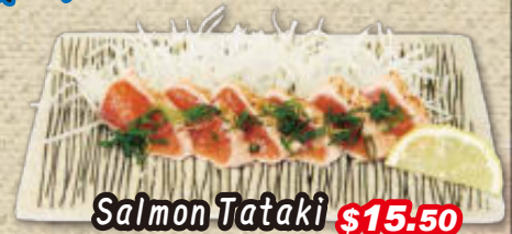
Salmon Tataki $15.50