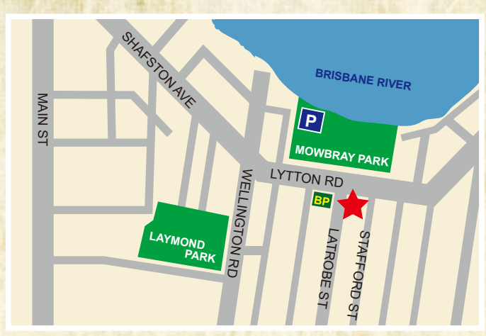
Parking is behind the East Brisbane Bowls Club across the road